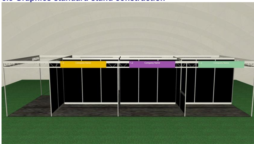
Figure 1. Example Standard stand construction by Thijs Standbouw.